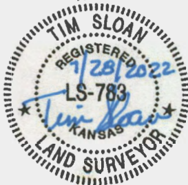
Tim Sloan, L.S. SMH CONSULTANTS

COLORADO SPRINGS 411 South Tejon Street, Suite i Colorado Springs, CO 80903 P: 719-465-2145