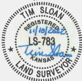
Tim Sloan, L.S. SMH CONSULTANTS

COLORADO SPRINGS 411 South Tejon Street, Suite 100 Colorado Springs, CO 80903 P: 719-465-2145