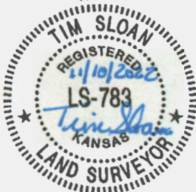
Tim Sloan, L.S. SMH CONSULTANTS

COLORADO SPRINGS 411 South Tejon Street, Suite i Colorado Springs, CO 80903 P: 719-465-2145